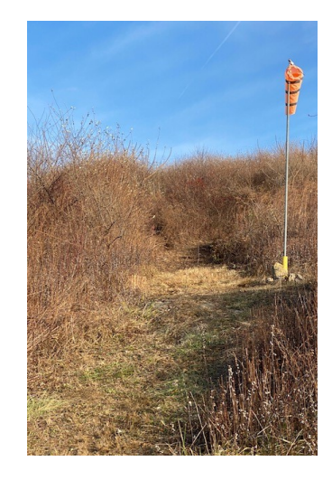
Path behind the wind sock to the top of the ridge.