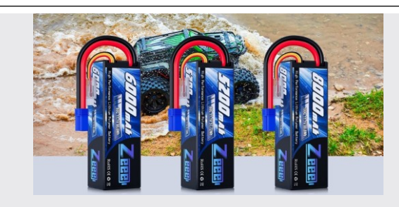
Zeee RC Lipo Battery official store