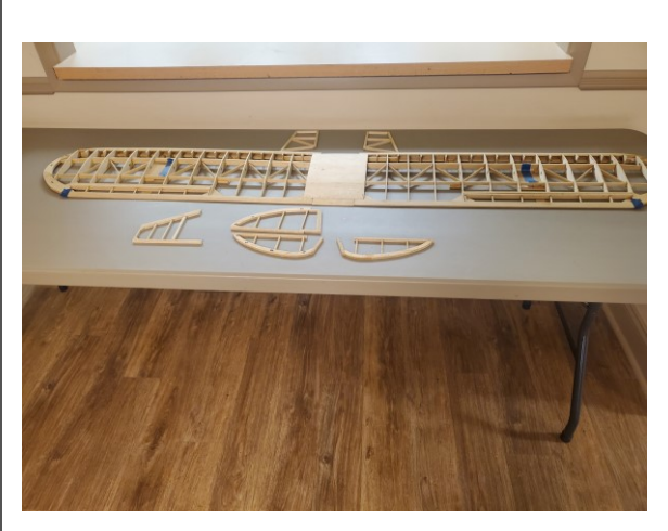
Figure 1 Matt Smith's Piper Cub Progress