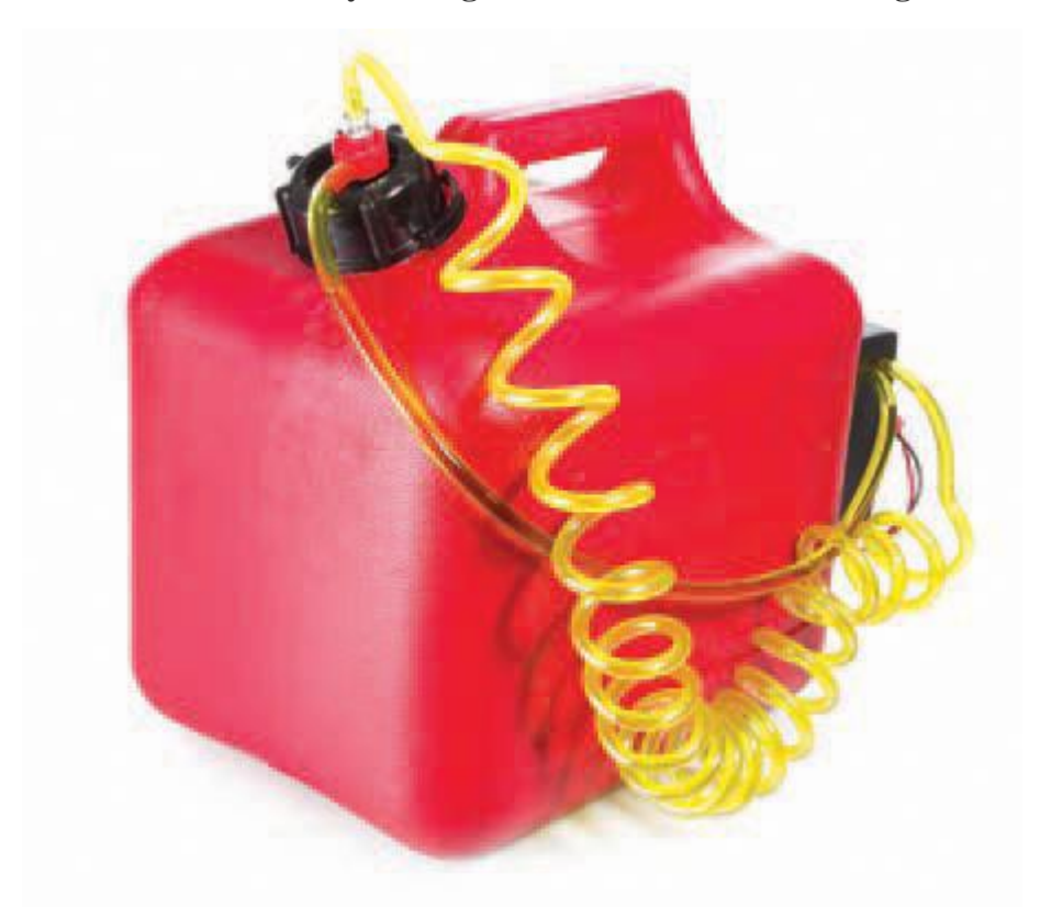
It is very important to keep your gasoline engine fuel clean and stored in a container that has a filter in the supply line.