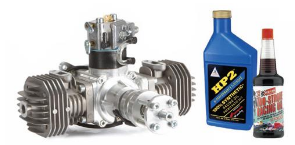
Regardless of the fuel-to-oil mixture ratio you use, it is important to use good-quality oil. Cheap oil can risk the health of your engine. The 40cc RCGF 40T engine is shown at the lower left.

When it comes to lubrication for gasoline engines, just like with any 2-stroke, you need to mix oil into your gas. The best thing to do is to read the instructions and follow the manufacturer's recommendations. Typical mix ratios are from 25:1 to 50:1, depending on the oil used. Some specialty synthetics can be mixed at 100:1. There are lots of great-performing, high-quality standard 2-stroke engine oils to choose from, and if you can't find something at your local hobby shop, you'll find them in small-engine shops and motorcycle- and marine-equipment outlets.