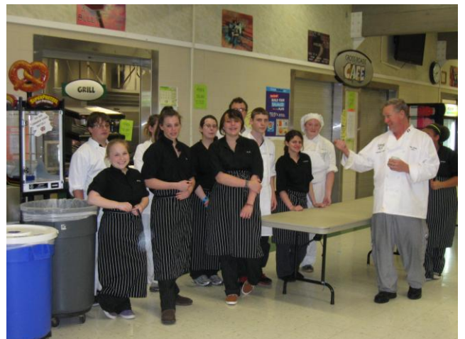
The Chef and Staff