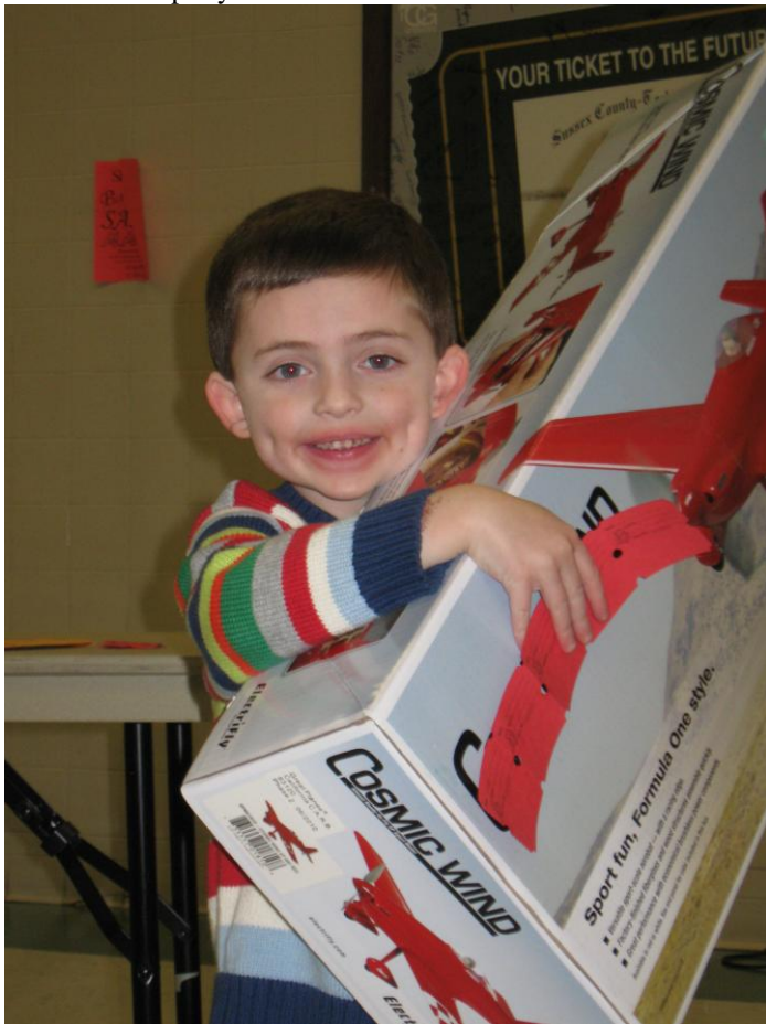
This little guy came to party expecting to win a plane – Santa made his dream come true.