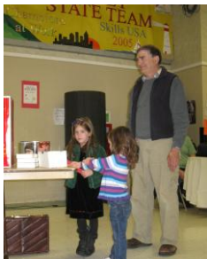
Some of Pat's Helpers.